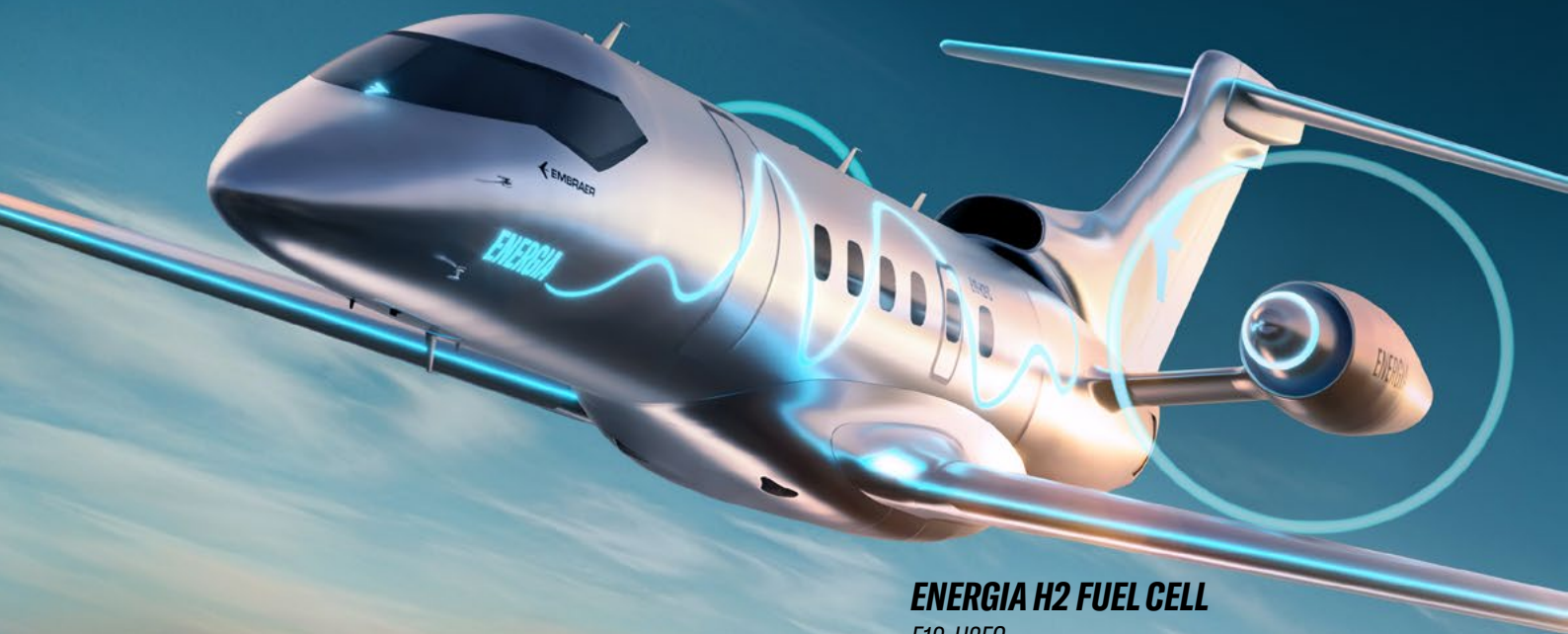
ENERGIA H2 FUEL CELL E19-H2FC